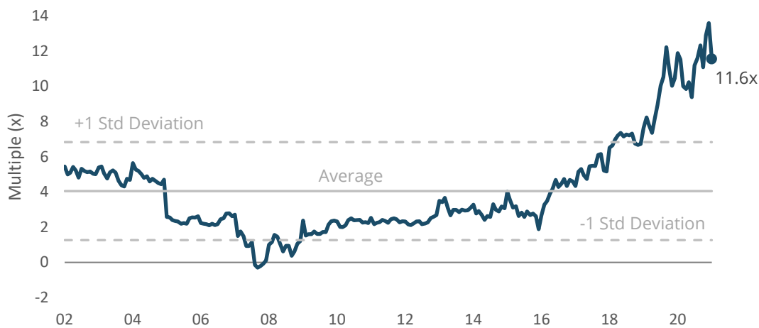
S&P 500 Growth P/E minus S&P 500 Value P/E Price to Earnings Next Twelve Months (1/1/2003 - 12/31/2021)

Bringing it all together at the micro level, the gap between "obvious quality" and "everything else" grew once again this year. As we have written before, quality is of paramount importance to us, but it must be "hidden quality," which the market is not yet paying for. We too are tired of the phrase "value vs. growth," but we cannot help including the below chart that highlights the historically huge difference between these two categories: