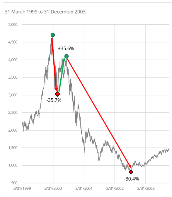
NASDAQ 100 2000-2002 Bear Market